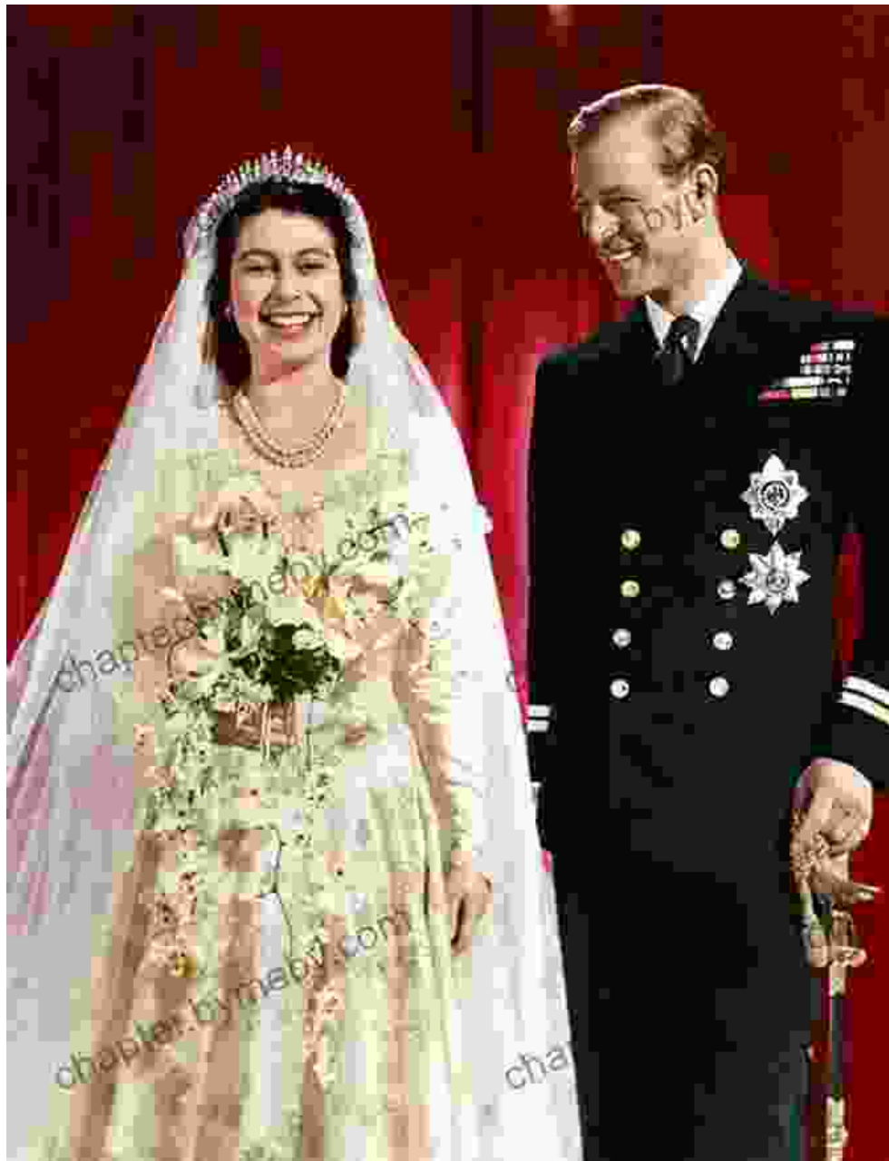
Elizabeth and Philip on their wedding day in 1947.

During the war, Elizabeth met Prince Philip of Greece and Denmark, a distant cousin. They fell in love and married in Westminster Abbey on November 20, 1947. Philip renounced his Greek and Danish titles and became the Duke of Edinburgh.