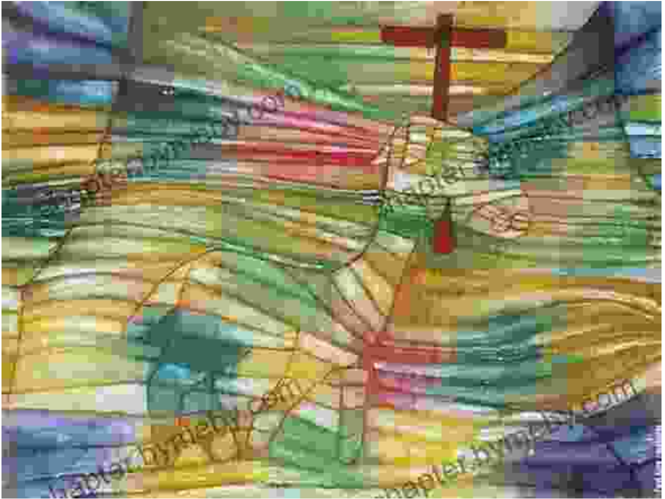
Twittering Machine , 1922, watercolor on paper, Museum of Modern Art, New York