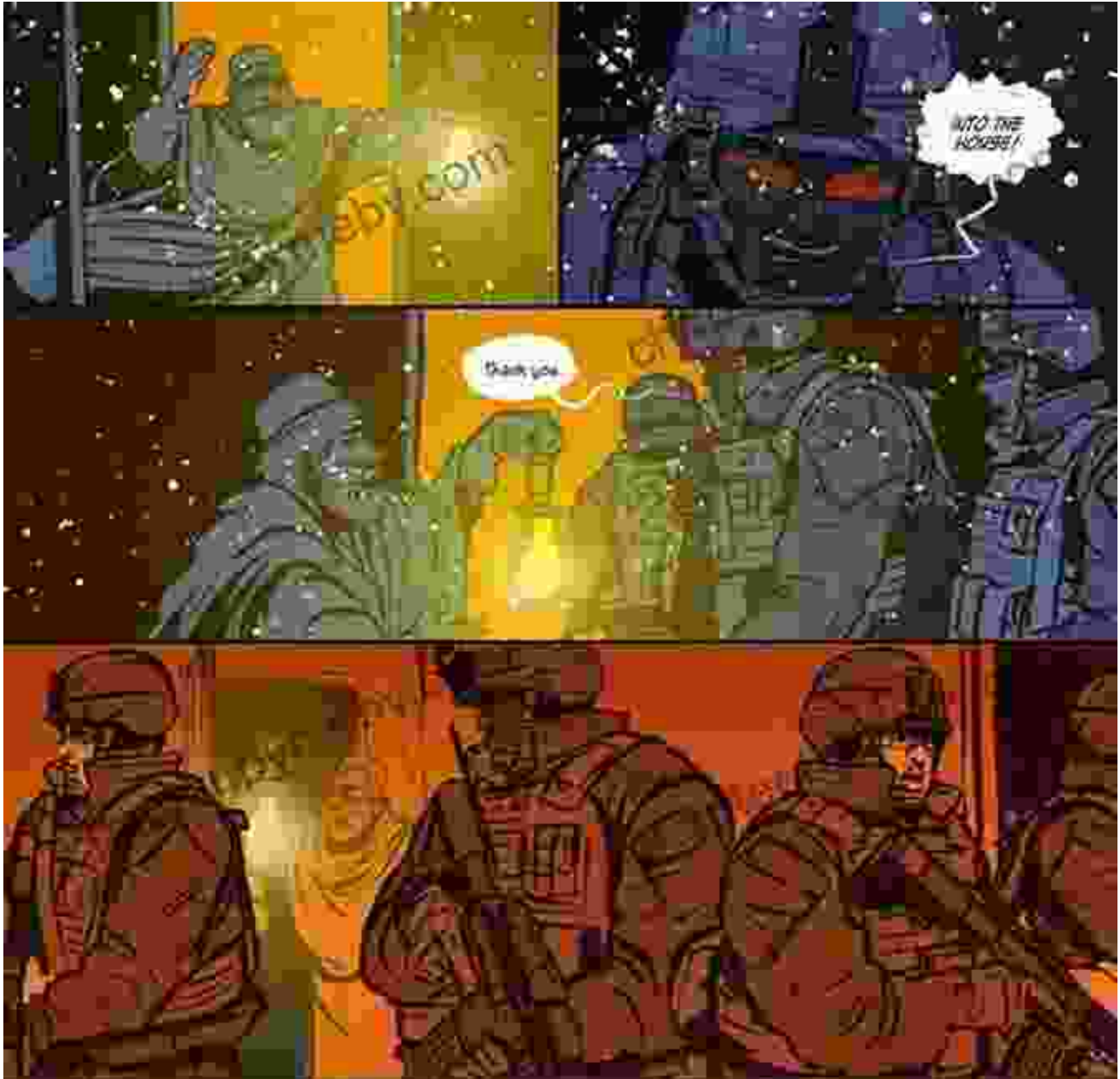
An illustration from "The White Donkey: Terminal Lance," showing Marines under fire in Afghanistan.