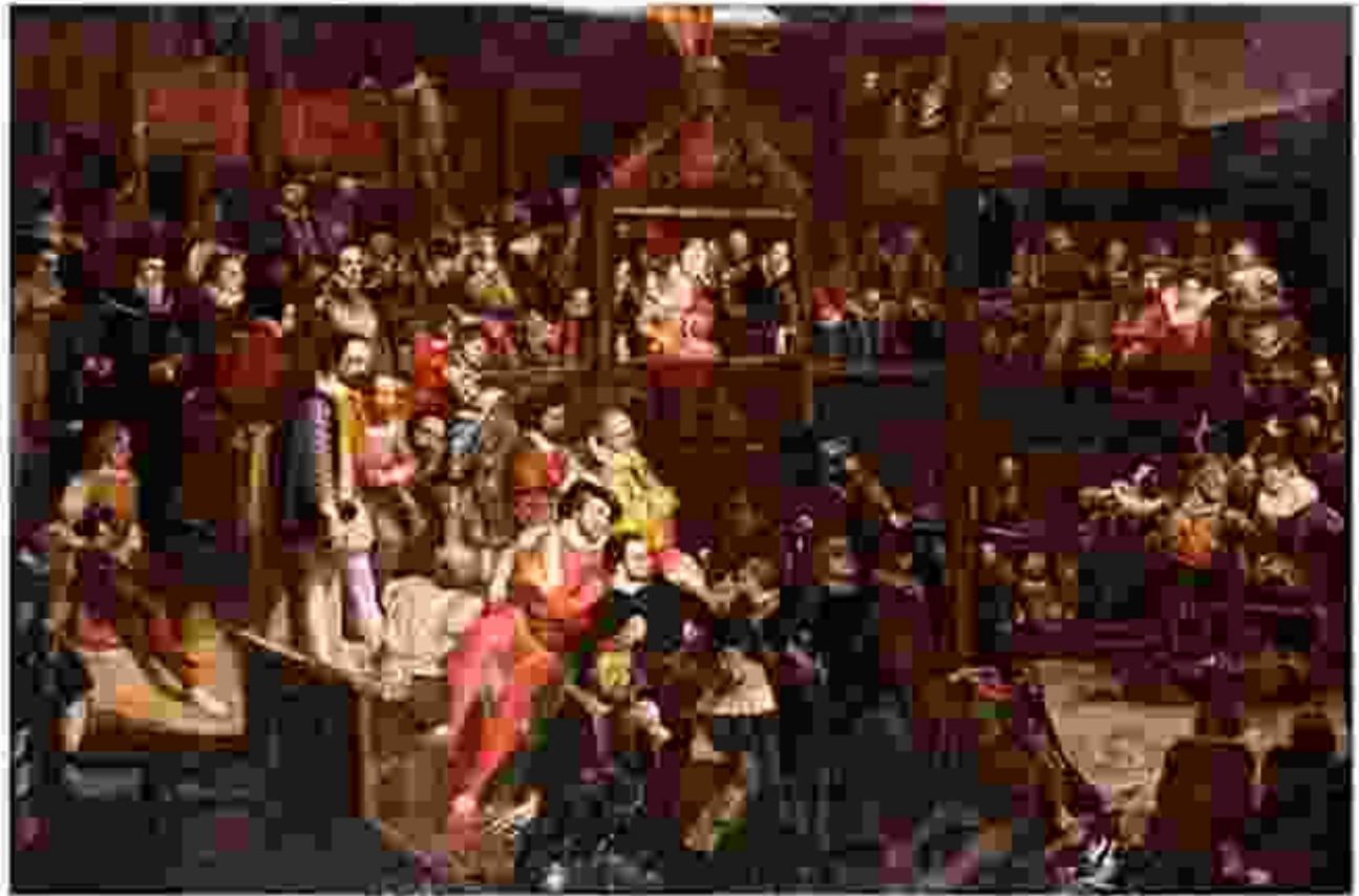
Windsor in the Elizabethan era